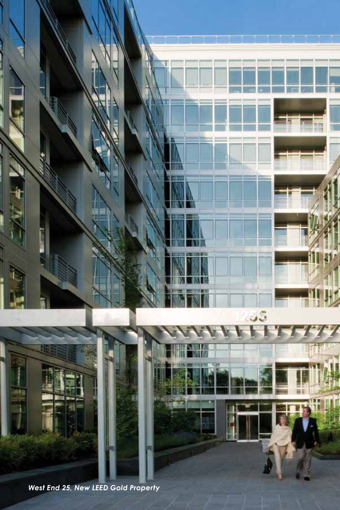
West End 25, New LEED Gold Property