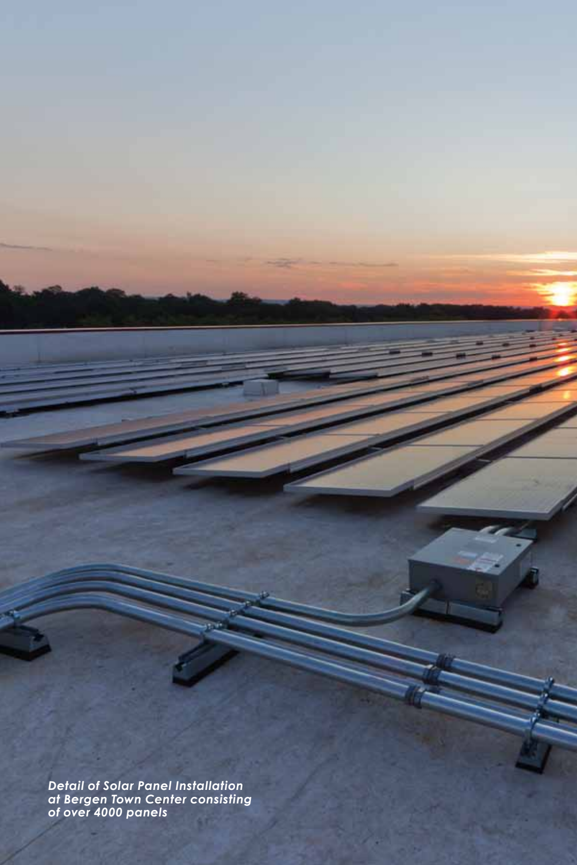
Detail of Solar Panel Installation at Bergen Town Center consisting of over 4000 panels