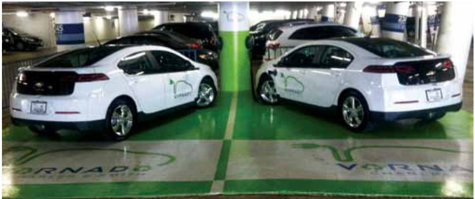
New electric Chevy Volts for DC Leasing Team