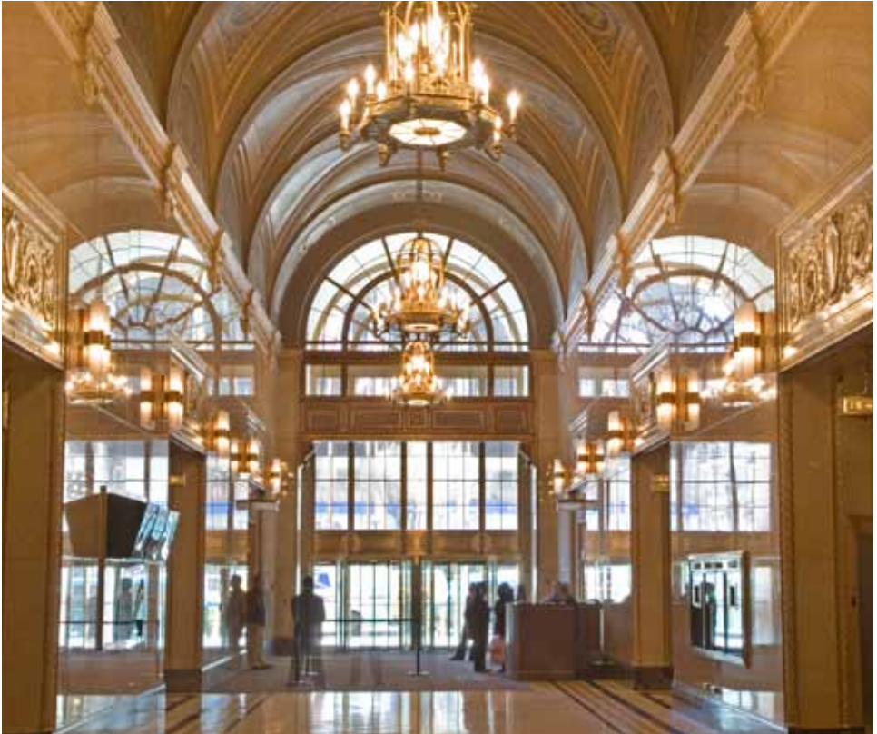
11 Penn Lobby Detail

Recycling and reclamation programs are essential to providing a sustainably built environment. By preventing the waste of potentially useful materials and reducing the consumption of fresh raw materials, recycling and reclamation projects help to reduce systemic energy usage and reduce the need for conventional waste disposal.