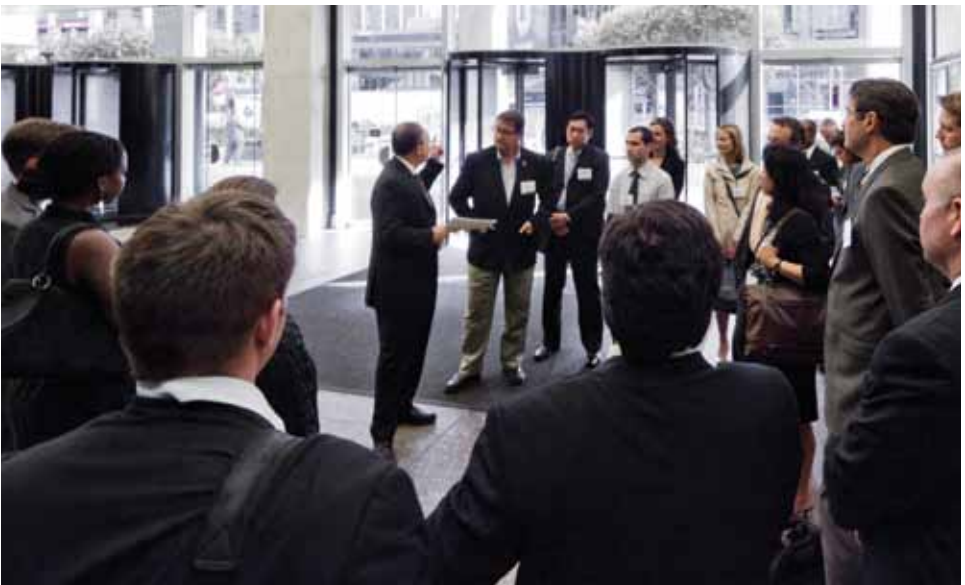
Vornado led tour of the Cogeneration Plant for the Urban Land Institute (ULI)