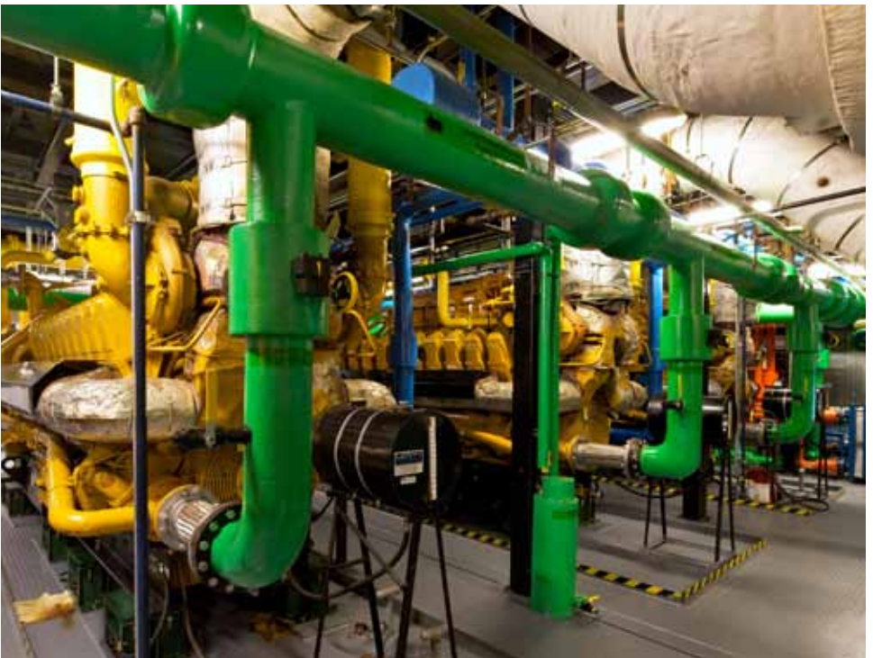
Cogeneration Plant at One Penn Plaza