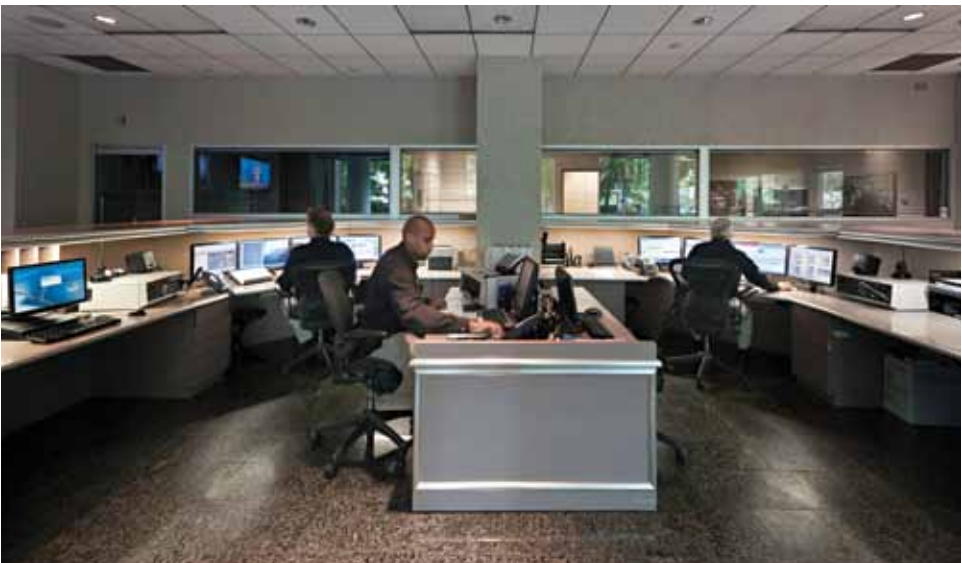
Tenant Service Center

Energy efficiency starts at home, and Vornado is pleased to announce that we recently completed a LED lighting retrofit in our corporate headquarters at 888 Seventh Avenue that resulted in a 30% decrease in our baseline energy consumption. We are working to replicate this program in common areas at other properties. Vornado also engaged site-level employees in energy efficiency by challenging them to accomplish a 10% year-over-year reduction in energy consumption. Four of our largest assets in New York were able to exceed this goal, reducing thousands of tons of carbon emissions and saving over $500,000 annually. Also of note in 2011, Vornado Retail successfully implemented several parking lot lighting retrofit projects across our retail portfolio.