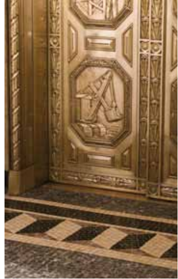
595 Madison Avenue Historic Elevator Doors

In the fourth quarter of 2011, Vornado commenced capital improvements in New York at 11 Penn Plaza and 595 Madison Avenue, two 1920s vintage buildings with original period details and ornamentation. Vornado's operations team was able to reclaim pieces of rare Botticino marble from old corridors in each building to construct new security desks in the building lobbies. The projects successfully yielded cost savings and reduced carbon footprints, while delivering a finished product that seamlessly matches the existing design.